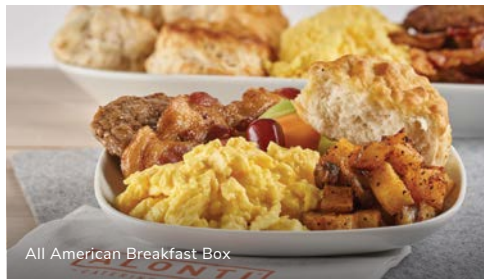
All American Breakfast Box