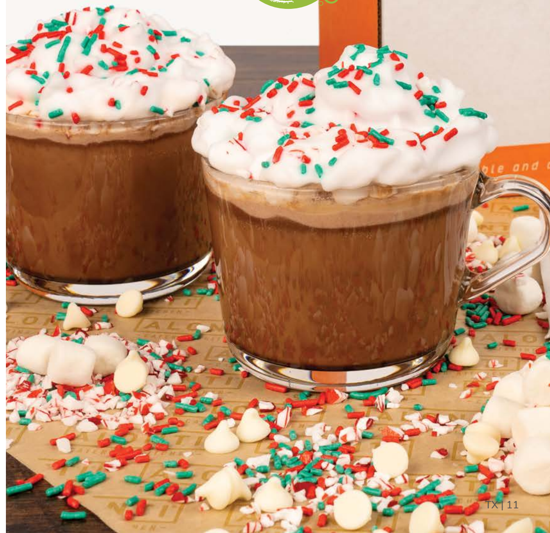
Hot Cocoa Bar