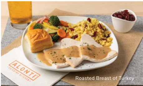
Roasted Breast of Turkey