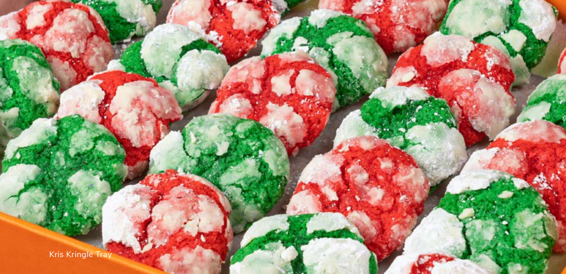
Kris Kringle Tray