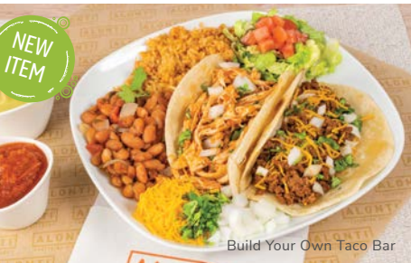
Build Your Own Taco Bar