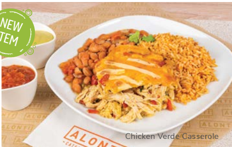
Chicken Verde Casserole