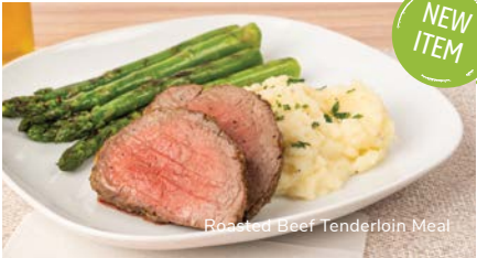
Roasted Beef Tenderloin Meal

Serves 10 | 700. Add 5 more servings | 350.