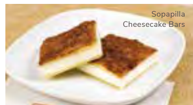
Sopapilla Cheesecake Bars