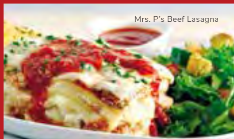
Mrs. P's Beef Lasagna

Sautéed onions, carrots, celery, garlic and bacon simmered with ground beef, marinara and a touch of cream, all mixed with penne pasta and topped with Parmesan cheese. Served with your choice of salad and fresh-baked baguette with butter.