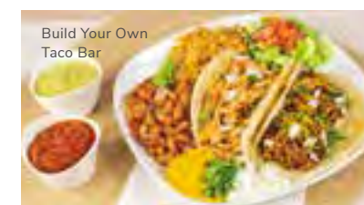
Build Your Own Taco Bar