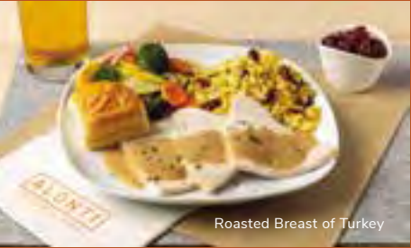
Roasted Breast of Turkey